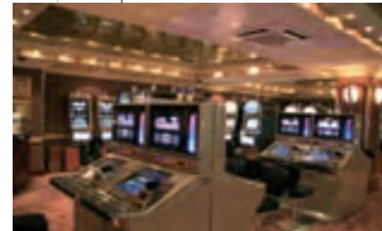
The Ridge Casino in Witbank, South Africa

The recent addition of 8 new AGI Gaminator® slant top machines in the New Africa Casino in Dar es Salaam, Tanzania, brought great excitement to guests at this busy hotel and Casino property. Following AGI Africa's successful installation of the slant-top version of the Gaminator® in La Palm Casino in Accra, Ghana, the operator KaiRo International did not hesitate in bringing this top-performing product to the eastern shores of Africa.