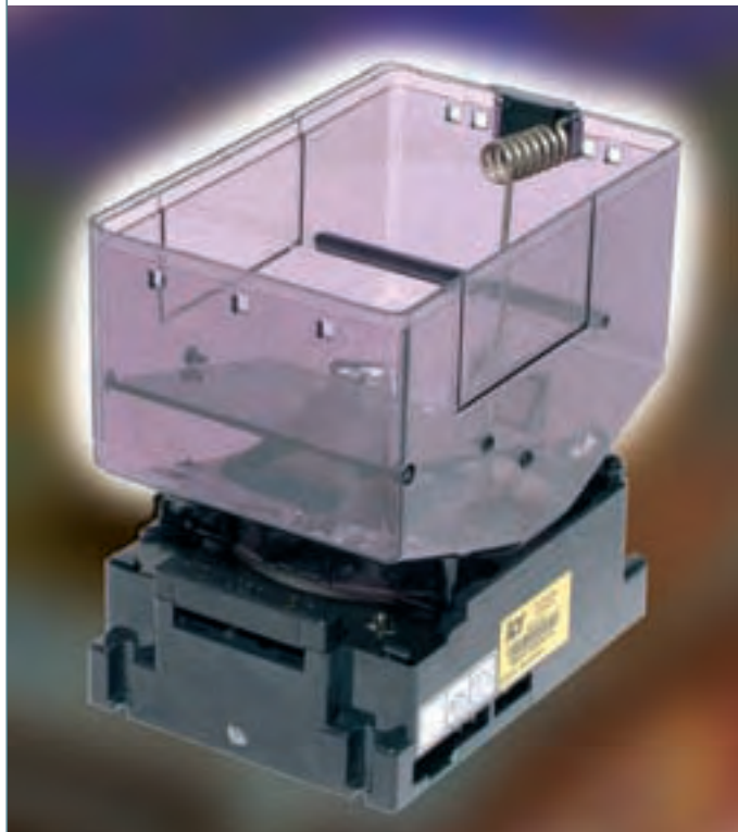
Leonid Series-Mini Hopper