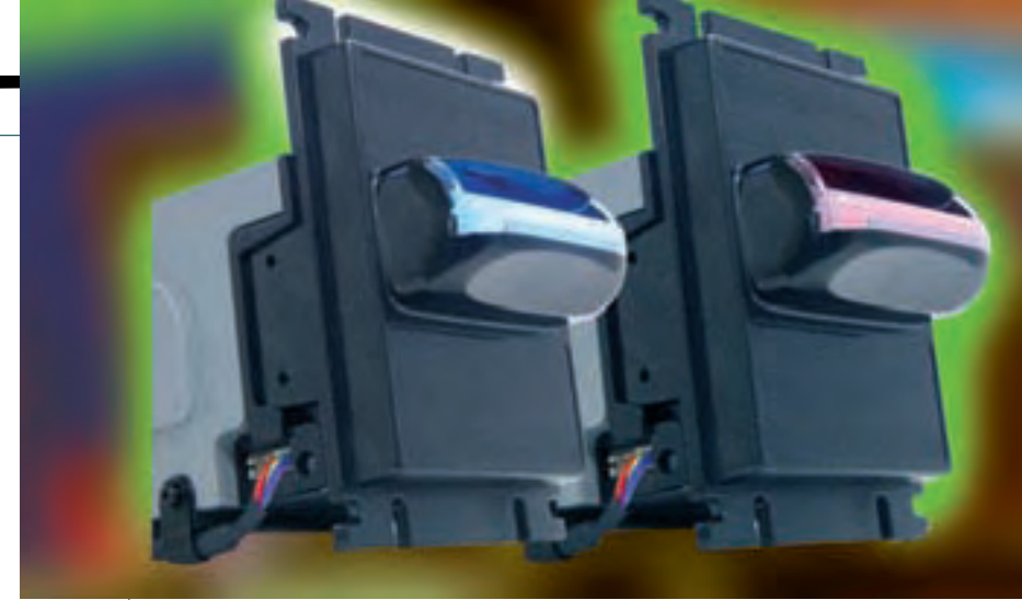
"L70", L Series