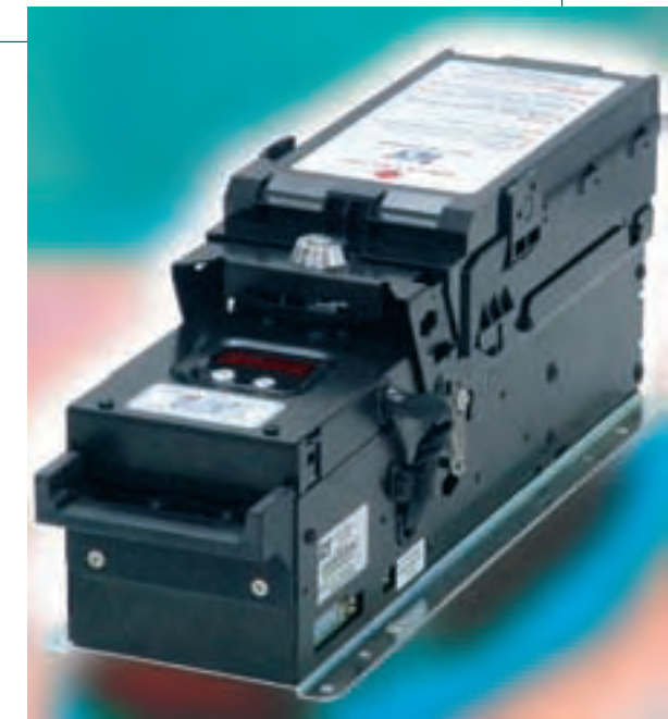
"K70", K Series