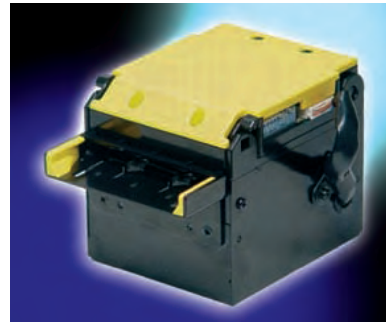
"E77", E Series