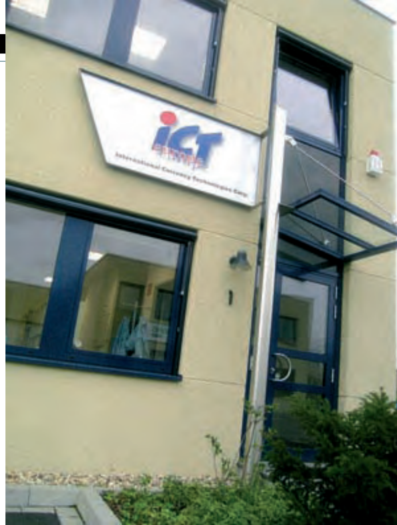
ICT Headquarter Europe

ICT's new generation bill acceptor, the "L" Series offers high security, innovative technologies, user friendliness and fast transmission. The unique design of the "L" series allows it to accurately verify need-to-know parts of banknotes, rejecting up to 99% of counterfeit bills. The new anti-pullback function and the latest mechanical technology also prevents "stringing", providing a high security environment. Because of its user-