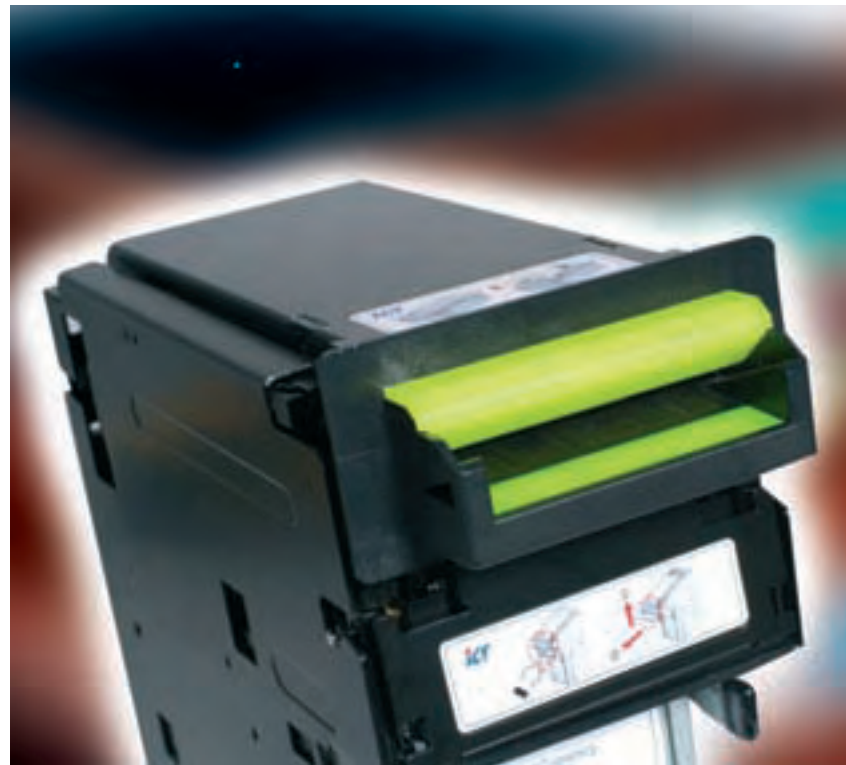
"J830", J Series