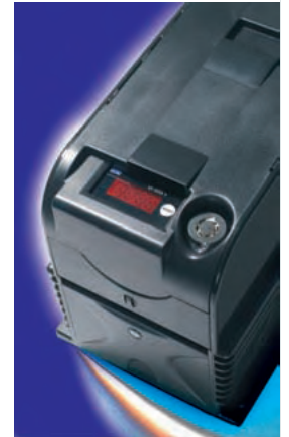
"ND-300KM", ND Series