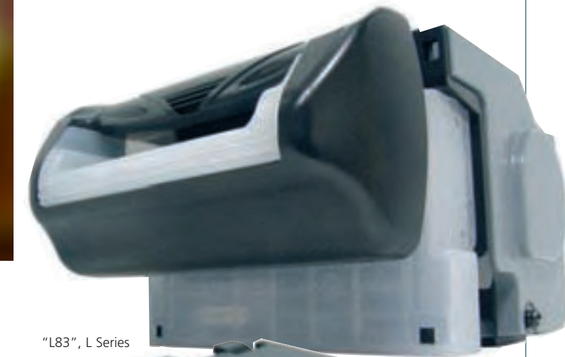
"L83", L Series