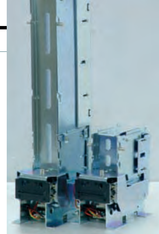
"CVD1000&300DE", CVD Series