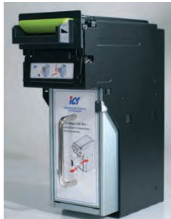
"J830", J Series