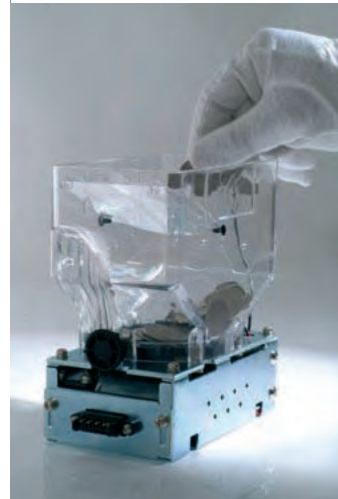
Super Mini Hopper, Leonid Series

ICT's "L" Series bill acceptor is equipped with a superior consumer interface, advanced processing technology, and progressive engineering to reject counterfeit bills, while instantly accepting legal