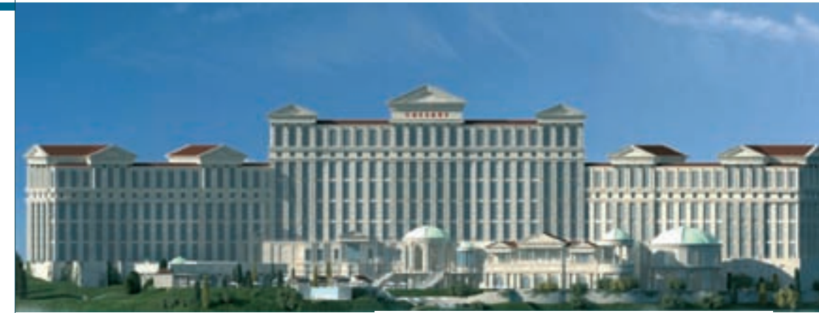
Model of the future Hotel Casino, a true copy of its Vegas counterpart