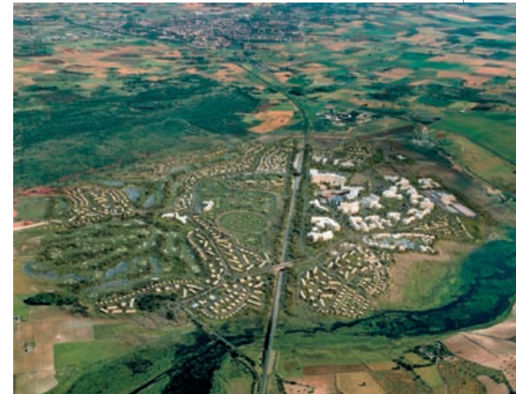
Aerial view of the future "Kingdom of Don Quijote"