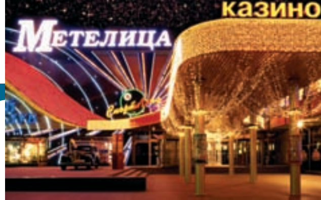
Casino Metelitsa, Moscow