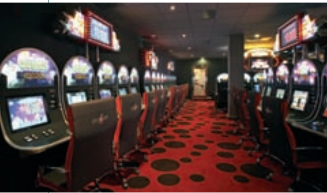
Zitro slots are one of the attractions of this gaming establishment