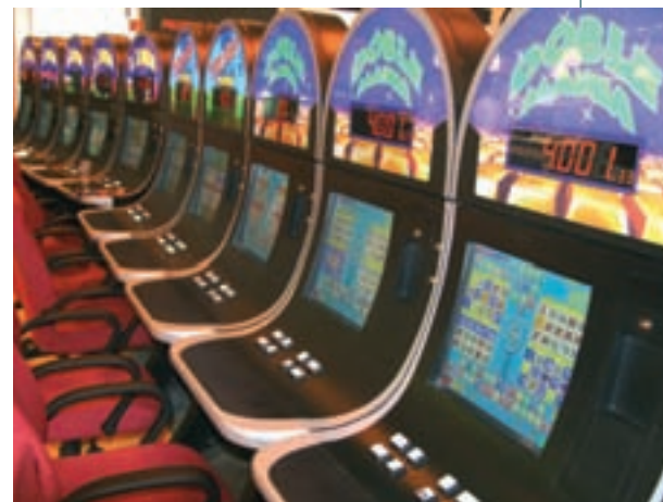
For a long time now, Metronia slots are fully up to European standard

Metronia also has commercial interests in China, where it is beginning to break onto the market.