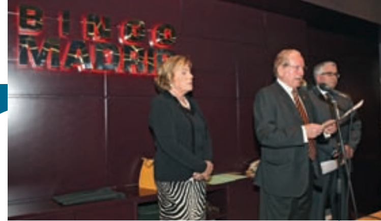
Guests are welcomed to the 25 th anniversary of Bingo Madrid

One of Global Zitro's main lines of activity is to offer the gaming sector initiatives aimed at obtaining dynamism and maximum returns. This description covers the work carried out at Bingo Madrid, Spain, where, to coincide with its 25 th anniversary, the new refurbishment of the facilities and the new alternative games annex were unveiled. Bingo Madrid was advised in these works by Zitro, creating spaces to guarantee relaxed, pleasurable gaming, thanks to the ergonomic design of the Zitro slots, comfortable chairs, delicate lighting, and the sound and light effects of each game.