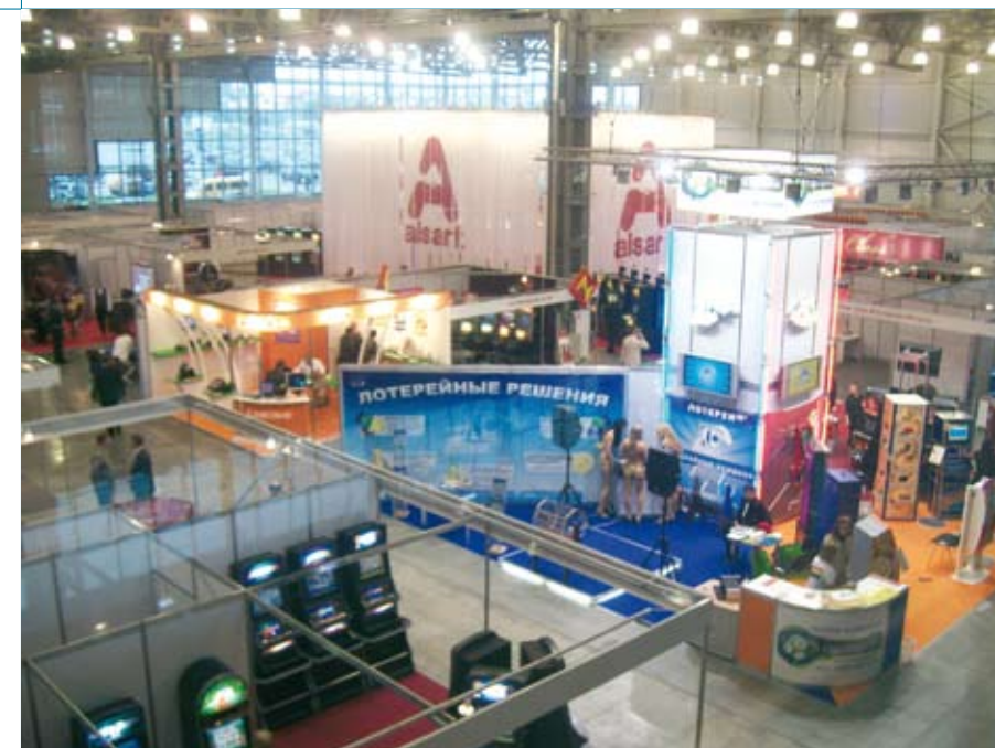
New Russian company AlsArt had the largest stand at the event