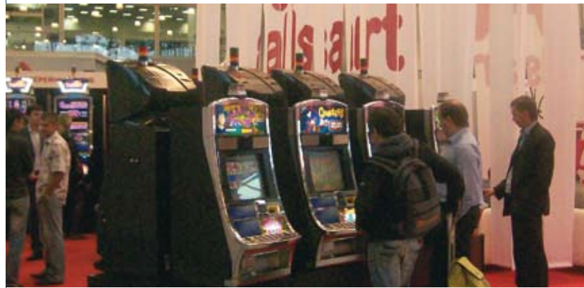
Slots from WMS Gaming (foreground) and Novomatic (background) were on show at the AlsArt stand