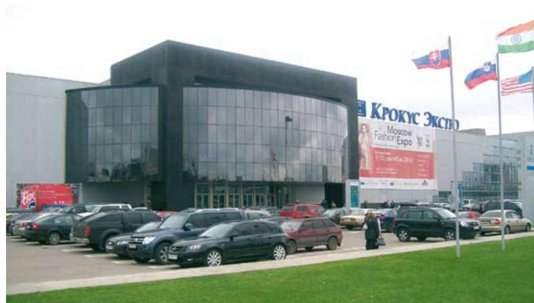
Crocus Expo exhibition centre in Moscow

This comes as no surprise if we factor in the uncertainty governing the industry, due to the new laws on the sector, which in 2009 will oblige all Casinos to be relocated in four zones, far from the major cities.