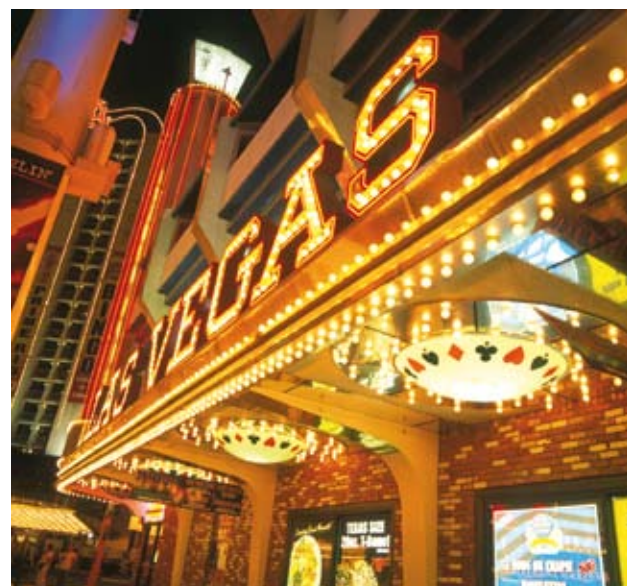
Union Plaza Casino, Las Vegas