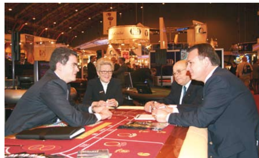
A picture from last year's edition, showing executives from Abbiati and Novomatic, two steadfast exhibitors at ICE