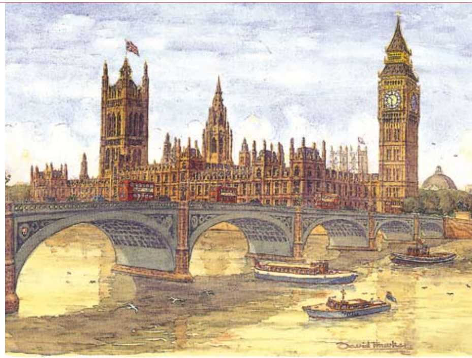
London - Houses of Parliament

Text: Ian Sutton