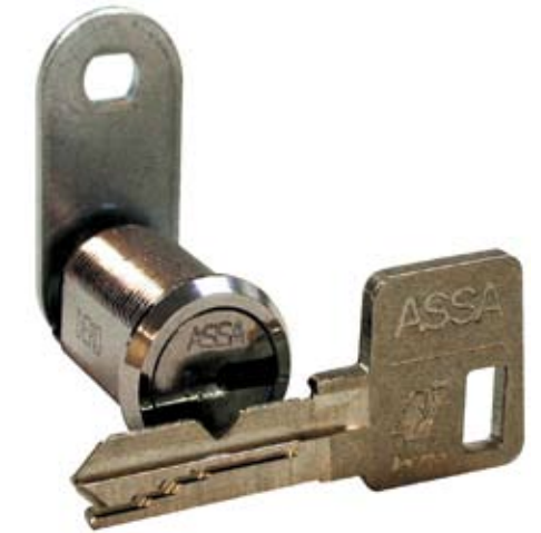
Assa Desmo locks

Understanding customer needs brought the German company Hess and Suzo together. Suzo offers the German made Polaris Casino Cash Self Service Centre. The Polaris is the complete self service cash redemption centre for the Casino industry. Manufacturers and end users can benefit from the continued dedication of Suzo International to the industry - the best products the industry can offer with a service to match. Further details are available on www.suzo.com