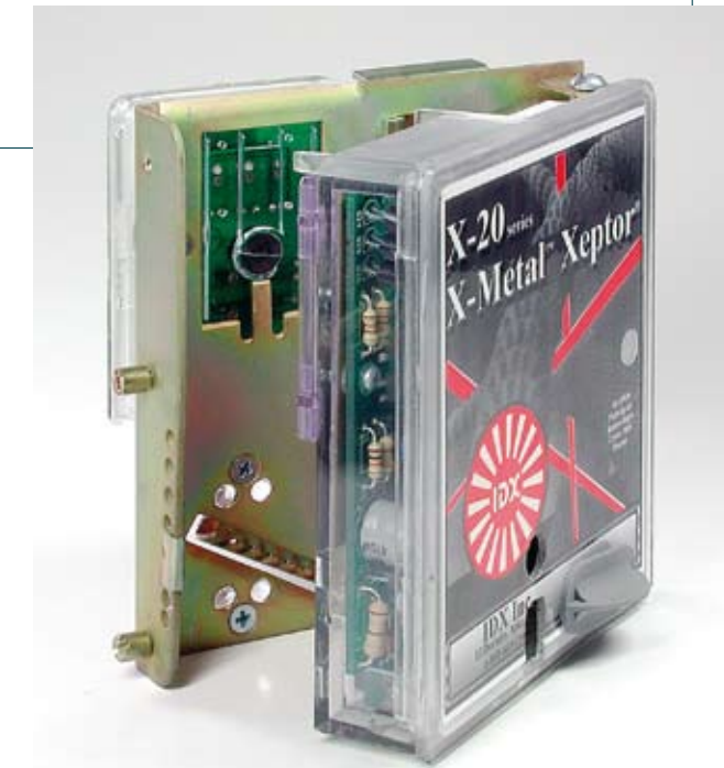
IDX X Series Casino Coin Acceptor