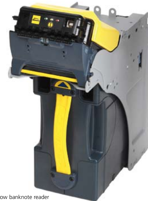
MEI Cashflow banknote reader