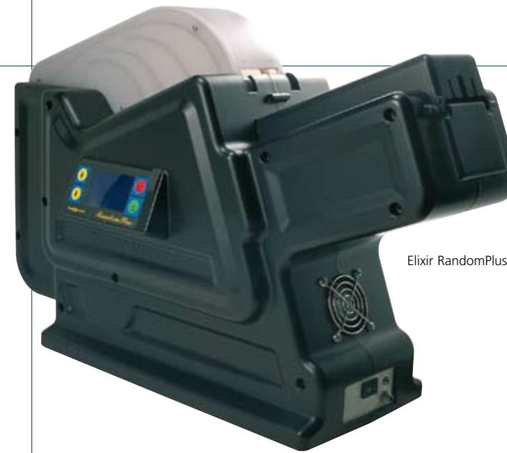
Elixir RandomPlus Shuffler