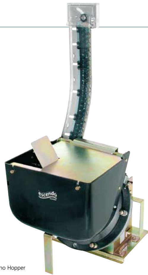
Suzo Escendo Casino Hopper