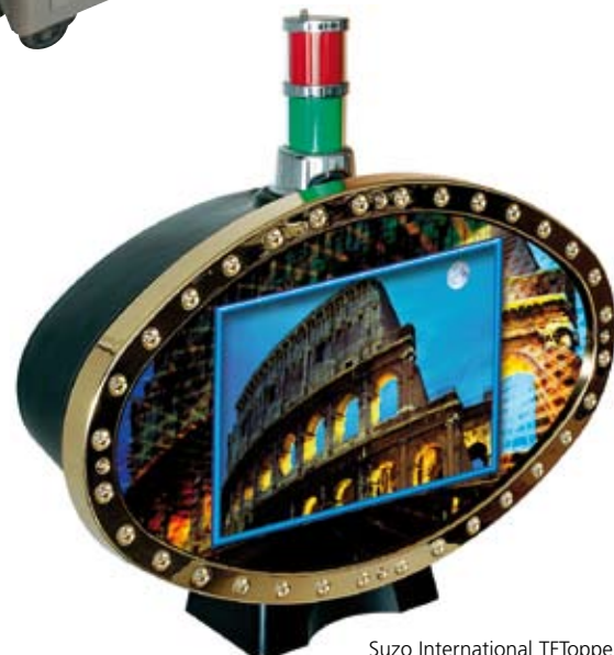
Suzo International TFTopper