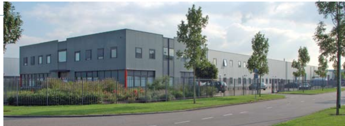
Suzo Headquarters, The Netherlands

Suzo International has been serving the coin-machine industry since 1955 when the Suvrein family realised the opportunity of supplying the local Dutch market with spare parts for juke boxes imported from the United States. The company has come a long way since then, to become the largest supplier of components and spare parts for the gaming and amusement industry. Over the years Suzo has become more and more international in its activities. In 1988 the first overseas branch was founded in Germany and management strategy has allowed for continuous company growth. Accordingly, in Europe alone Suzo International now has branches in the UK, Germany, Spain and Poland, along with three branches in South America - in Argentina, Uruguay and Brazil. In 2004 Suzo International teamed up with Happ Controls in the USA to form the Suzo-Happ Group. The Suzo-Happ Group has continued to grow, incorporating more and more well-known companies. Advanced Electronic Systems (AESI) was the first company to join the group, also in 2005. AESI is based in Las Vegas and is very active in the American gaming industry. AESI supports several respected component suppliers, including MEI, Futurelogic, Kortek and Elixir Gaming.