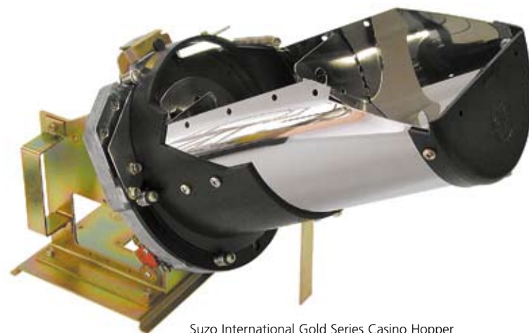
Suzo International Gold Series Casino Hopper