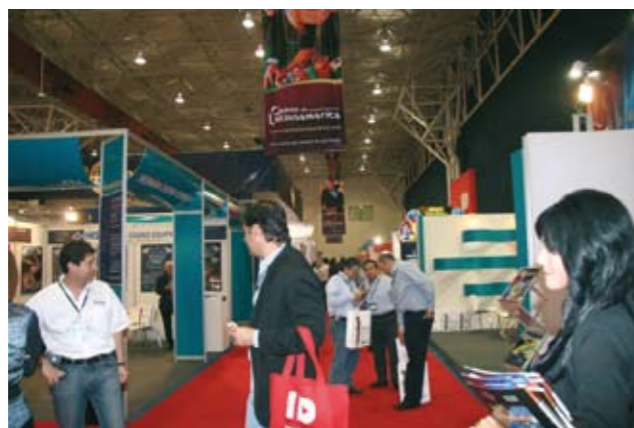
An image of the first issue of ELA, held in Monterrey. The stand of Casinos de Latinoamérica , the leading trade magazine in the region, was one of the favourite meeting points for visitors.