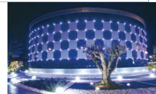
The poker room at Casino Gran Madrid