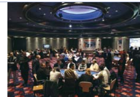
Atmosphere at a tournament

On a different note, the Casino has also held a series of festive events to celebrate its Thousand and One Nights. Almost 16 million guests have visited the Casino, where 43 million roulette balls were thrown, over 25 million cards were dealt, and 67 million games of blackjack, 14 million of punto y banca and around 2 million poker hands were played.