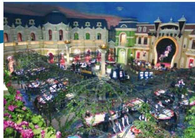
Casino Paris, in the centre of Moscow, considered one of the most elegant in Europe, will be just one of the many victims of the erroneous Russian gaming plan

If the government's plans are followed through, there will be a severe drop in State revenue through gaming taxes. When there is no money to fix the roads or build new hospitals, who will explain this impulsive and unfounded decision to the Russian public?