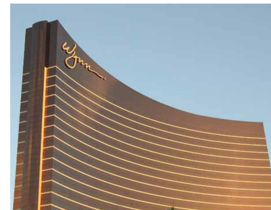
Casino Wynn Las Vegas