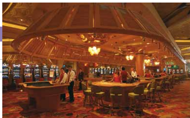
Monticello Grand Casino

The highest-earning Casino was Monticello Grand Casino, with 36.1%, followed by Marina del Sol with 14.6%, Enjoy Antofagasta with 13.4%, Dreams Temuco with 8.8% and Gran Casino with de Copiapó 5.2%. Also with regard to Gran Casino de Copiapó, on 29 July last, the Supervisory Board approved the share transfer between the two Spanish companies Grupo Nervión and Egasa, with the result that Egasa is now the sole owner.