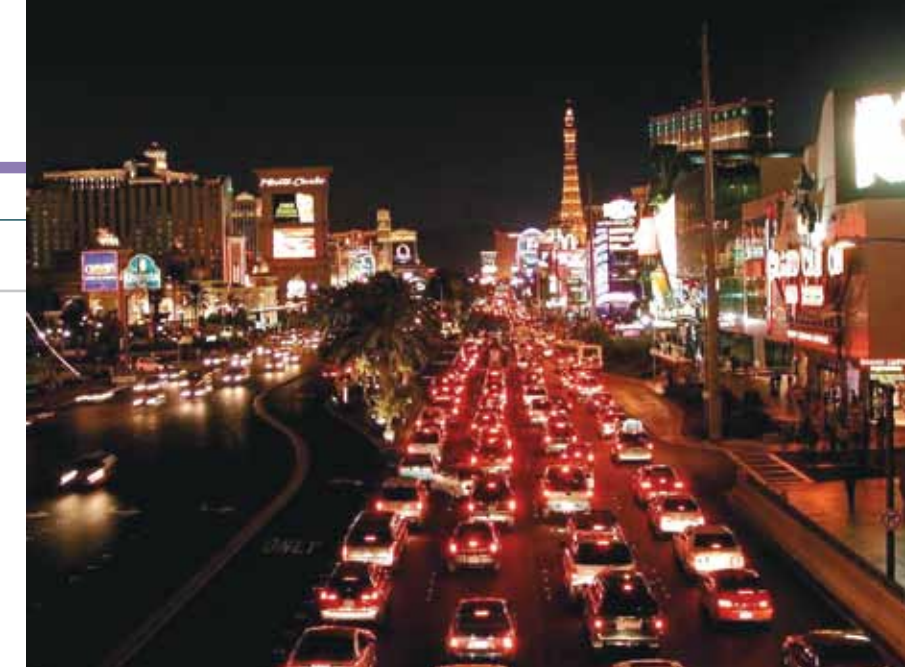
The famous Strip, Las Vegas