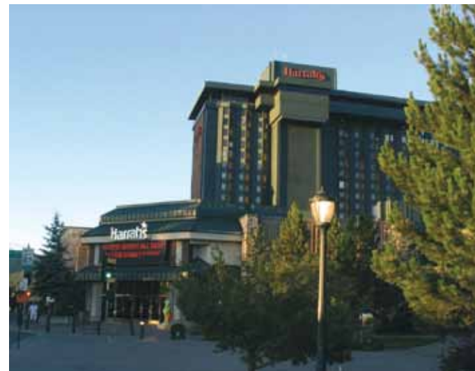
The Conference was held at Harrah's Hotel

Besides the plenary sessions, over 100 other presentations were discussed at the concurrent sessions.