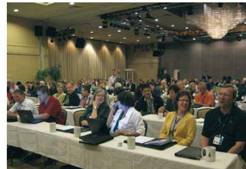
One of the plenary sessions is about to start and the room is filling up.