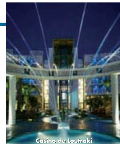
Casino de Loutraki