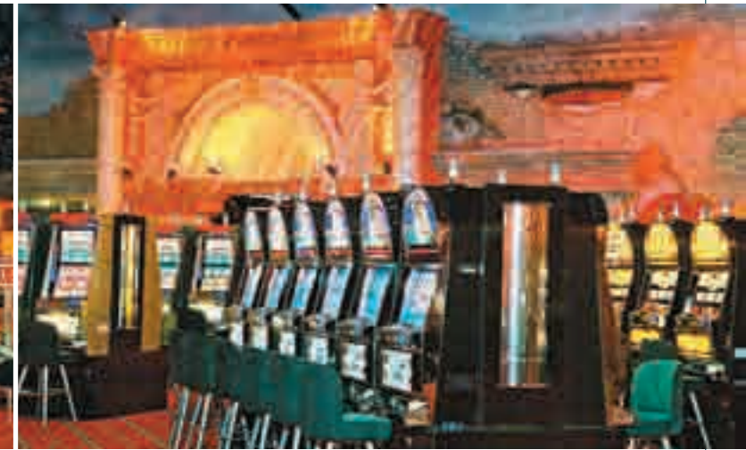
Casino Admiral Colosseum

Kleinhaugsdorf/Haté. The opening of the Colosseum coincided with the date of the 2004 enlargement of the European Union, underlining the symbolic bridging role of the Casino in this border area. An additional 10 Casinos and gaming outlets are proof positive of the Group's in-depth engagement within the Czech Republic.