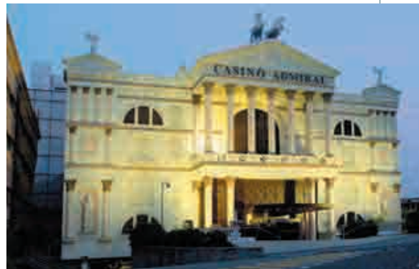
Grand Casino Mendrisio