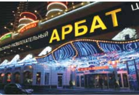
The neon lights of Arbat street have not been turned on for some time now

Sergei Baidakov, Government Vice Chief in Moscow explained, " We are seriously concerned at the increase in technologies springing up to replace Casinos. Almost one third of the 525 Casinos and slot halls in Moscow have opened lottery centres to sell instant lottery tickets, and the number of cyber-cafes giving access to online gaming has tripled since July ". Since the dread 1 July, the Russian police have closed over 1000 underground gambling dens, including 40 Casinos, and confiscated 93 tables and over 13,500 slots.