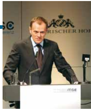
Donald Tusk, Prime Minister of Polonia

The Polish Congress has approved recently a green paper to bar gambling in locations other than Casinos. If passed, all slots currently installed in bars, cafes, service stations and shopping centres will have to be removed. The measure could affect some 50,000 slots. Even though it has been ratified by Lech Kaczynski, the Polish President still has doubts regarding the law, which will be put before the Polish Constitutional Court for a report to be issued.