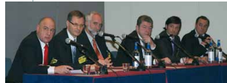
One of the ICC sessions held last year at the London fair