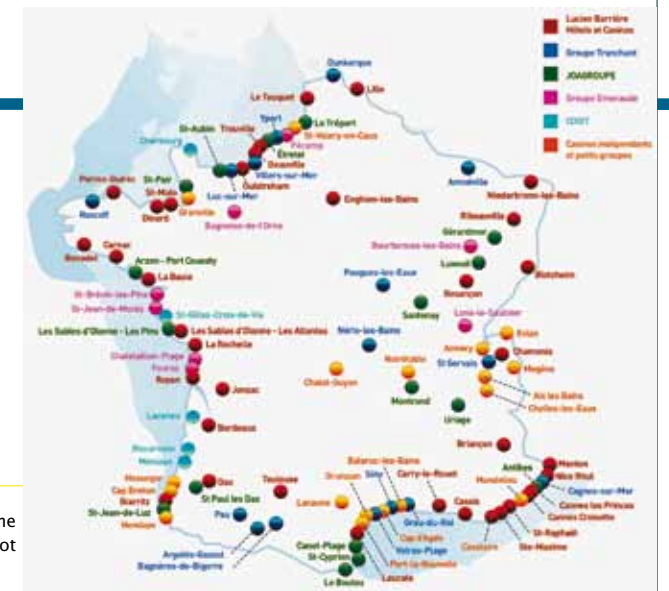
Map showing the Casinos networked in the Magic Casinos Jackpot

A hundred French Casinos are taking part in the Magic Casinos Jackpot which will pay one lucky winner a millionaire prize: by end of November the jackpot stood at €2 million. And the amount is growing. The jackpot is open during 24 hours by day. The participants in this Jackpot are the 35 Lucien Barriere Group Casinos, 17 Joa Groupe Casinos, 16 from the Tranchant Group, 8 from the Emeraude Group and 24 independent Casinos.