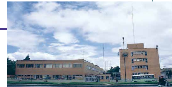
Headquarters of Recreativos Franco in Bogota, Colombia