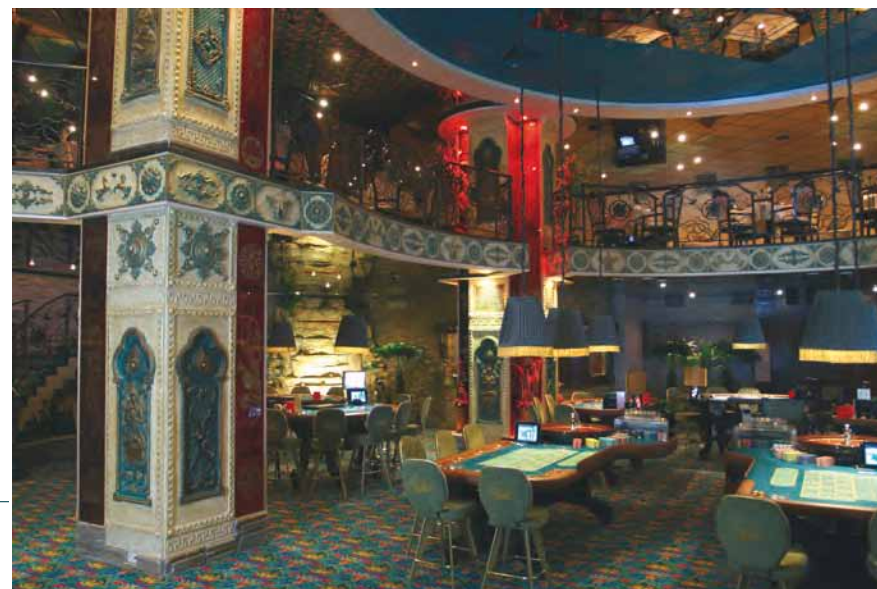
Casino Erevan, owned by Storm Group

The Armenian Parliament has approved changes in legislation under which, from 1 January 2013 onwards, Casinos may be located only in Tsahkadzor, Kotayk, Sevan and certain other government-designated areas, including Yerevan's Zvartnots International Airport and duty-free zones to be created close to the airport. At present, most Casinos are located along the road from Yerevan to the airport. The country currently has 11 Casinos and 103 gaming arcades.