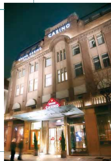
Grand Casino Helsinki

In the Casino industry, as in others, optimum purchasing decisions can have an immediate and positive impact on operations. Great purchasing decisions stand the test of time and provide years of positive returns. Gran Casino Helsinki made such a decision over two and half years ago when it acquired CASHFLOW SC, a product that has exceeded all expectations. After a Value-Added Trial (VAT) over two and a half years ago, the Casino now specifies CASHFLOW SC on all slot purchases.