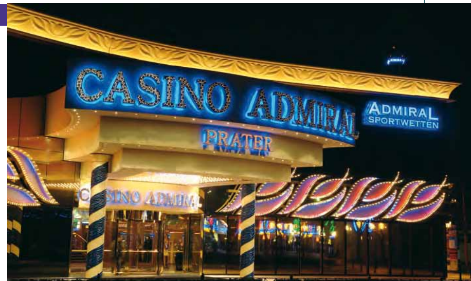
Big companies such as Novomatic, owners of Casino Prater, who have at all times complied strictly with legislation, will not be affected by the new rule

A limit of 15-20 operating licences will be granted, under very strict conditions, one being that that companies operating under the new licences may not have any one shareholder holding more than 25% of the company. Slot users will also be obliged to carry a card that will identify them accurately, in order to establish a spending limit on all slots and video-lottery terminals in the country.