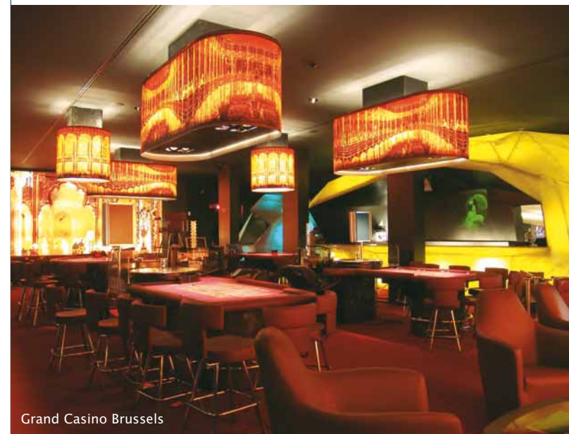
Grand Casino Brussels