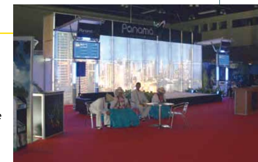
One of the many deserted stands at the fair. This is the tourist office, which one would expect to be one of the busiest

The newest edition of Sagse Panama was held recently, with an almost complete absence of European companies. Once more, the event was a total failure, with a meagre trickle of visitors and very few exhibitors. Although the organisers of this sham fair insist on holding the event year after year, the truth is that it just does not have the support of the industry.