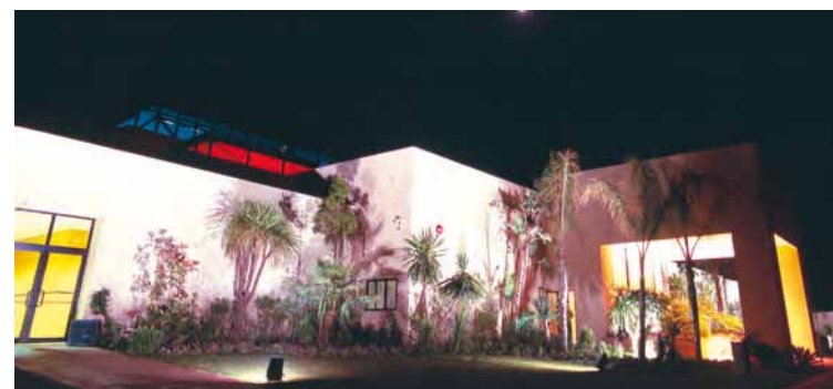
Casino San Roque, recently closed

The effects of the economic crisis are also being felt in the gaming sector. Over the past quarter, two Spanish Casinos have had to close their doors. The first was Casino San Roque, owned by the French Partouche group. After several years of falling visitor numbers and revenues, the group abandoned its activities in the south of Spain. Spanish group Casinos del Mediterráneo has also closed Casino de Villajoyosa, with losses of over EUR 14 million in 2009, even though the owners had invested over EUR 30 million in it over the past decade.