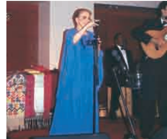
María Dolores Pradera in concert