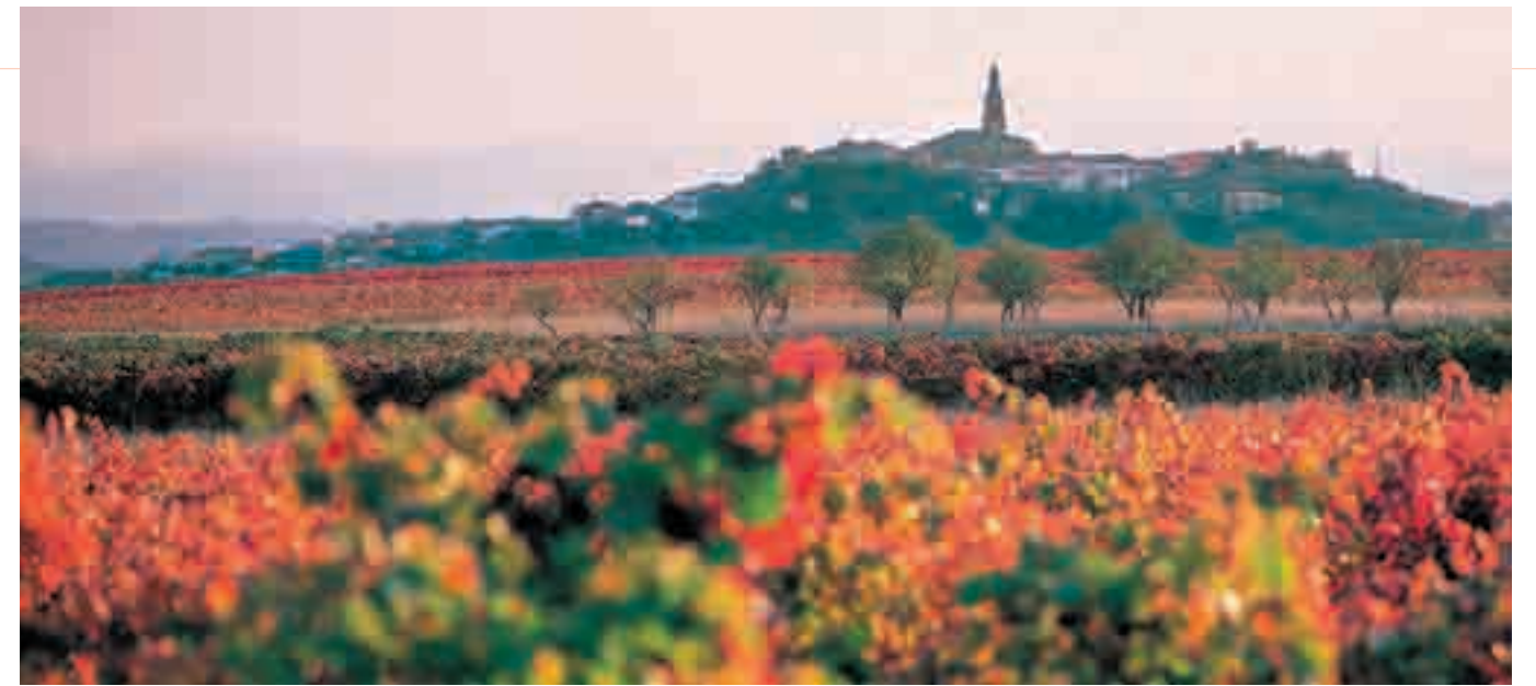
Vineyards in La Rioja

Covering just over 5,000 Km2 and with a population of barely 263,644, the Autonomous Region of La Rioja, in the north of Spain, is one of the smallest in the country. La Rioja is known internationally for the quality of its wines, exported worldwide. Logroño, the capital, and commercial and industrial centre of the region, has preserved its past with pride and, though continuing to develop as a modern, dynamic city, it still offers an abundance of historical, monumental and gastronomic wealth. On 25 May the region got its first Casino. Situated right in the centre of Logroño, it is owned by the Orenes-Recreativos Franco Group, which manages it through the Electra Rioja Gran Casino company. This prestigious holding also owns several other Casinos in Spain and Croatia. The inauguration party surpassed all expectations with some 800 guests, including local authorities, entrepreneurs and socialites. One of the most famous personalities to walk up the red carpet was