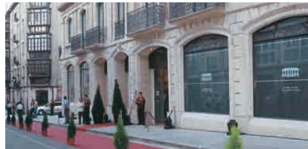
Façade of the Casino