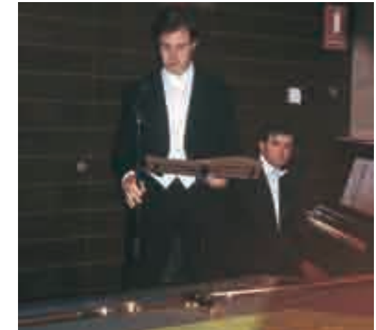
Miguel Ángel Olano, tenor, during his act

of the main international manufacturers, with Slots from Recreativos Franco, Unidesa Gaming and WMS Gaming; gaming tables and layouts from Hispania Casino Equipment; cylinders and chips from Gaming Partners International (GPI); cards from Fournier, and markers and Chipper Champ Plus from TCSJOHNHUXLEY.