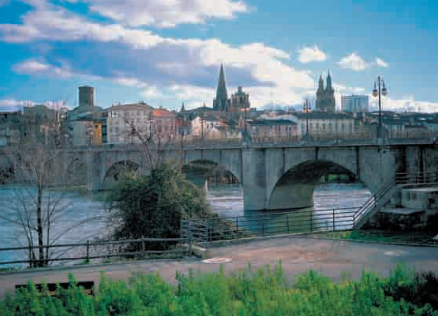
Old stone bridge over the Ebro in Logroño, on the Santiago Route