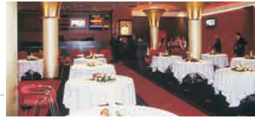
The Bingo hall