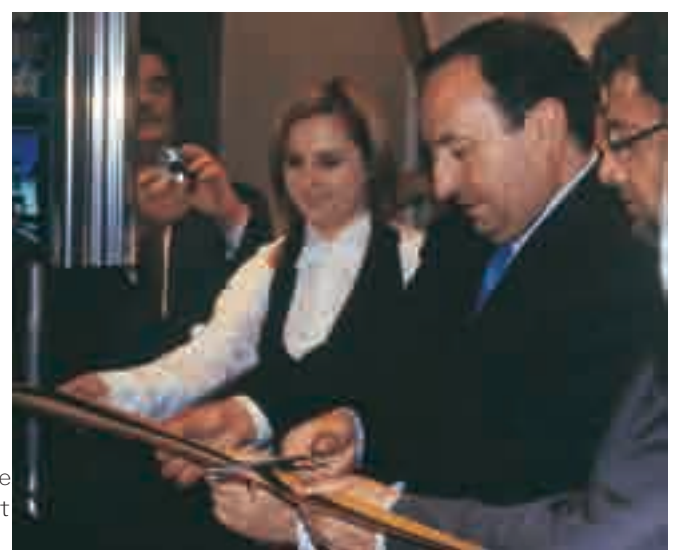
Cutting the ribbon

final speech was given by the President of the Government of La Rioja, Pedro Sanz, who said he was very proud of the Casino: "It will be one of the big enterprises of the region. It gives distinction to the city and will be a very big tourist attraction. The Mayor and President were entrusted throwing the traditional first roulette ball, which fell on 1, red, odd and low. The "City of Logroño" leisure, catering and gaming centre has spaces for exhibitions, social events and even a 16th century bodega. The walls are decorated with the works of several artists. Modern