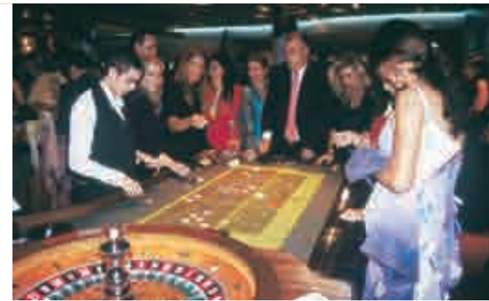
Atmosphere at the Casino