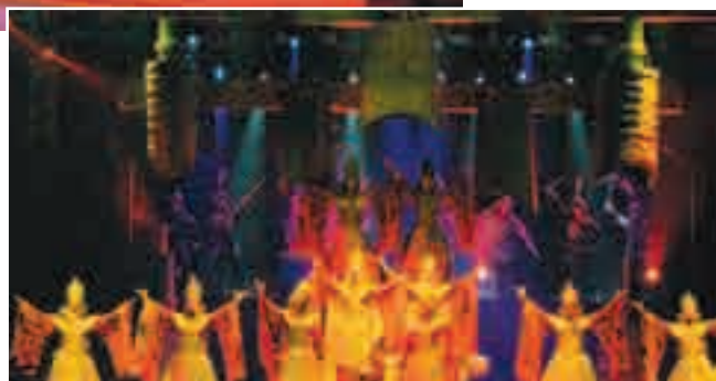
Performance during the Gala Dinner

The best of the events held in conjunction with the fair was, without a doubt, the Gala Dinner organised at the former Recreativos Franco centre in Madrid.