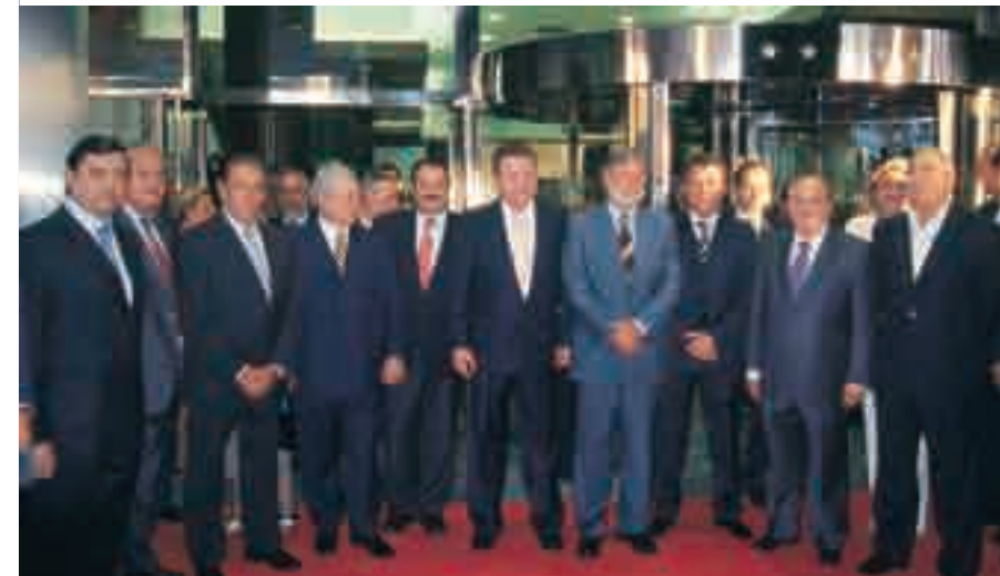
Owners with municipal and regional authorities

5-star NH hotel, a top-class restaurant and other amenities. The new Casino required an investment of €1 million, double the initial forecast. The Orenes-Franco Group owns the complex together with "Río Hostelería y Decoración", "Isim Cartago" and entrepreneur José Luis Iniesta. The Casino, equipped with state-of-the-art material from the main international manufacturers, has 13 gaming tables: