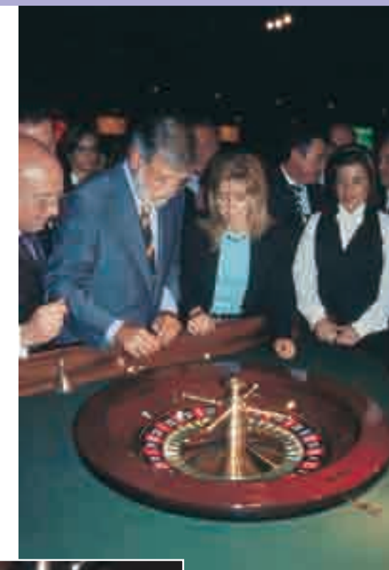
Throwing the first roulette ball: 21 red odd low

coming from Portugal, given its proximity to Badajoz. The figure is expected to increase substantially from the second year onwards. The Leisure complex has 350 full-time employees (129 croupiers), 60% of whom are women. All have had to undergo a rigorous 7-month training programme. The lessons have even included a course on "Portuguese for Croupiers".