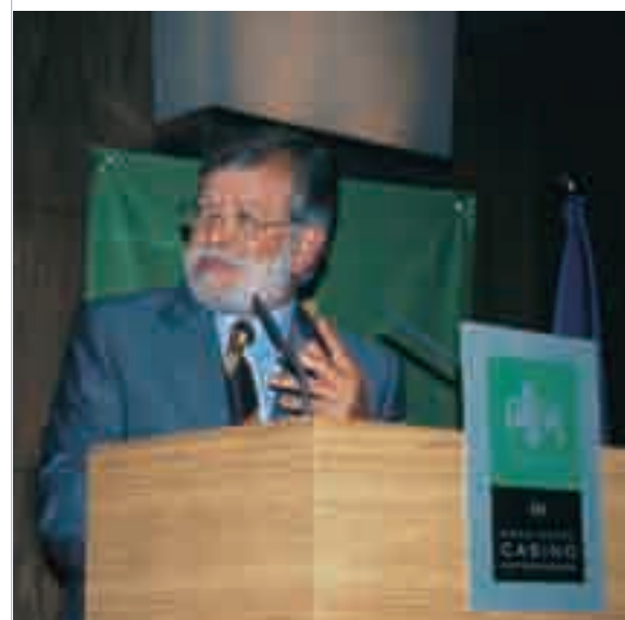
Juan Carlos Rodríguez Ibarra