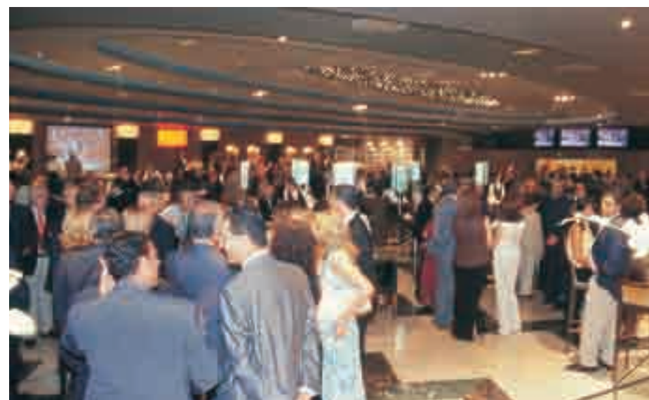
Atmosphere at the Casino