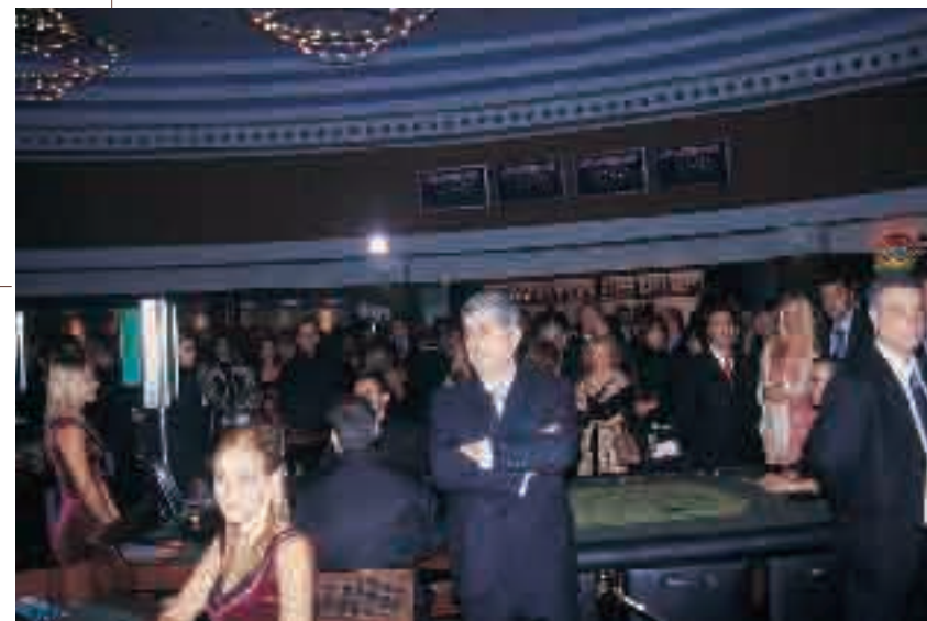
Some of the 1.000 guests at the inauguration party

Discover it today at www.dekinternational.com | info@dekinternational.com | Head office: Panama +507 204 2910