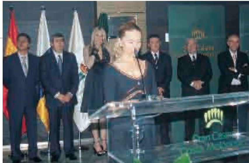
Concepción Narváez, Mayor of San Bartolomé de Tirajana, during her speech