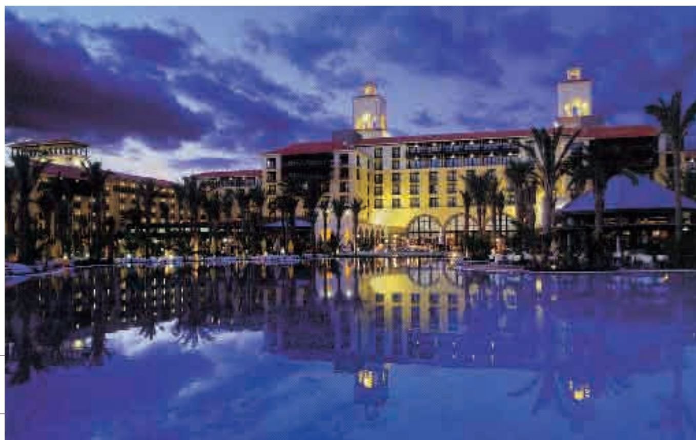
Gran Hotel Costa Meloneras, home to Gran Casino Costa Meloner