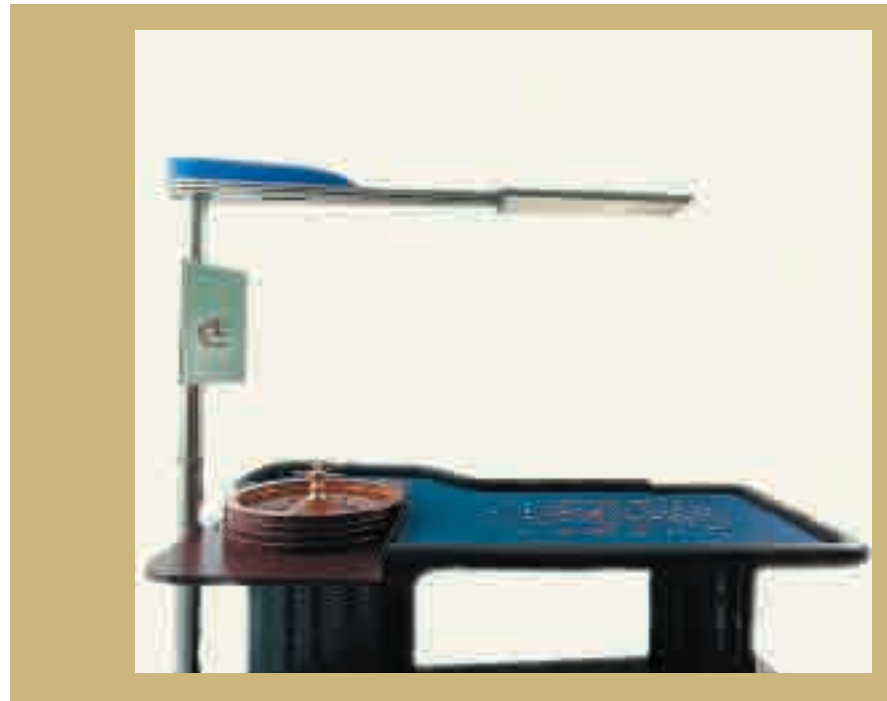
The Magic Table System MTS

Based in Switzerland, one of Europe's most modern and sophisticated Casino backgrounds, CasLife's core business lies in planning, building and operating Casino processes. CasLife, based in Zurich, focuses mainly on the conception and development of solutions for the live gaming sector and Casino operations as a whole.