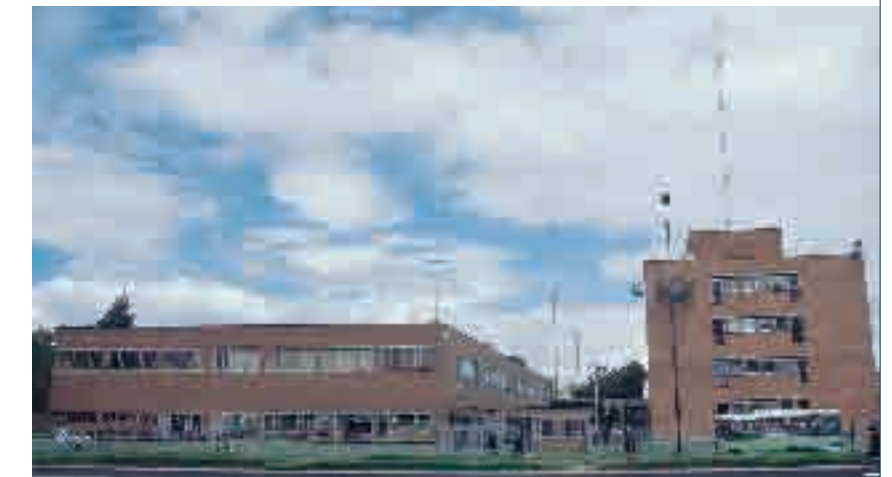
The RF Factory in Bogotá

Accordingly, Rete Franco Italia was incorporated, which