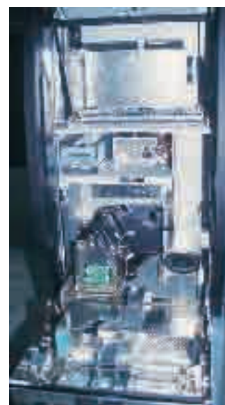
Inside of an "Xpassion" series slot machine

Another sign of identity of the R. Franco Group has always been the immediate incorporation of the latest available