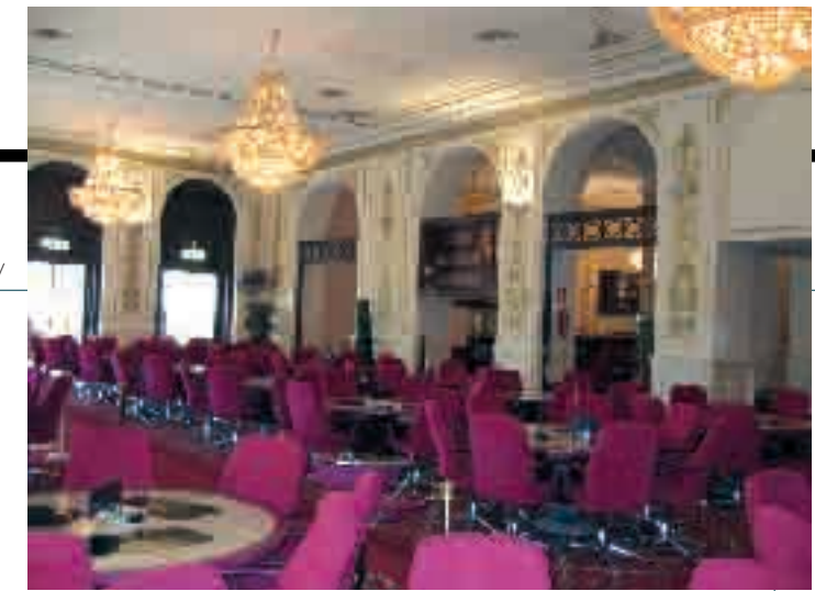
Bingo Hall Orenes-Genoa, Italy