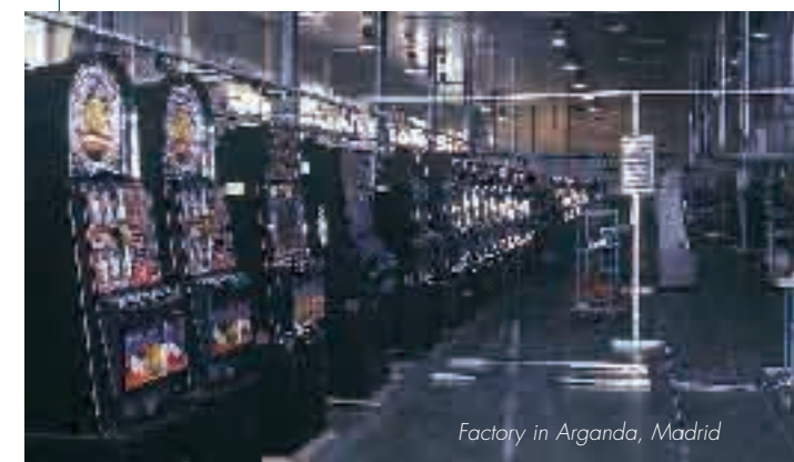
Factory in Arganda, Madrid

technological innovations in its games. To do this, the Group dedicates an enormous human and economic effort to its R+D department, which is a fundamental element in the production chain of the various models of slot machines. This department is acknowledged worldwide as one of the most advanced in the gaming sector. The sum of know-how and experience of its staff creates not only new patents but also technological solutions that multiply the efficacy of previous projects and IT applications that lead to new gaming offers and incentives. Similarly, this R+D department creates innovative and attractive designs for the furniture in