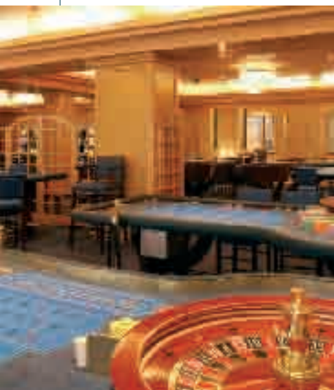
The Casinos Group Miro in Croatia has RF slots machines

technological innovations in its games. To do this, the Group dedicates an enormous human and economic effort to its R+D department, which is a fundamental element in the production chain of the various models of slot machines. This department is acknowledged worldwide as one of the most advanced in the gaming sector. The sum of know-how and experience of its staff creates not only new patents but also technological solutions that multiply the efficacy of previous projects and IT applications that lead to new gaming offers and incentives. Similarly, this R+D department creates innovative and attractive designs for the furniture in