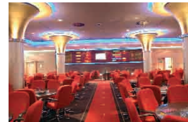
Bingo Hall in Logroño, Spain