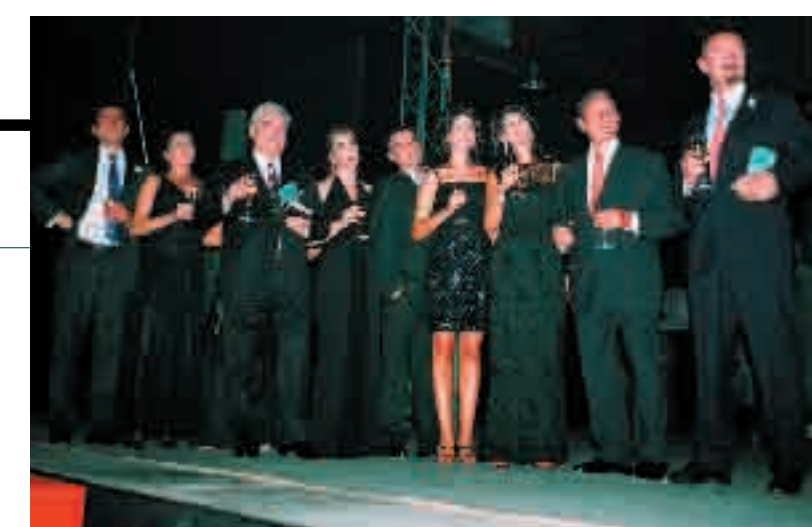
The Franco family in full