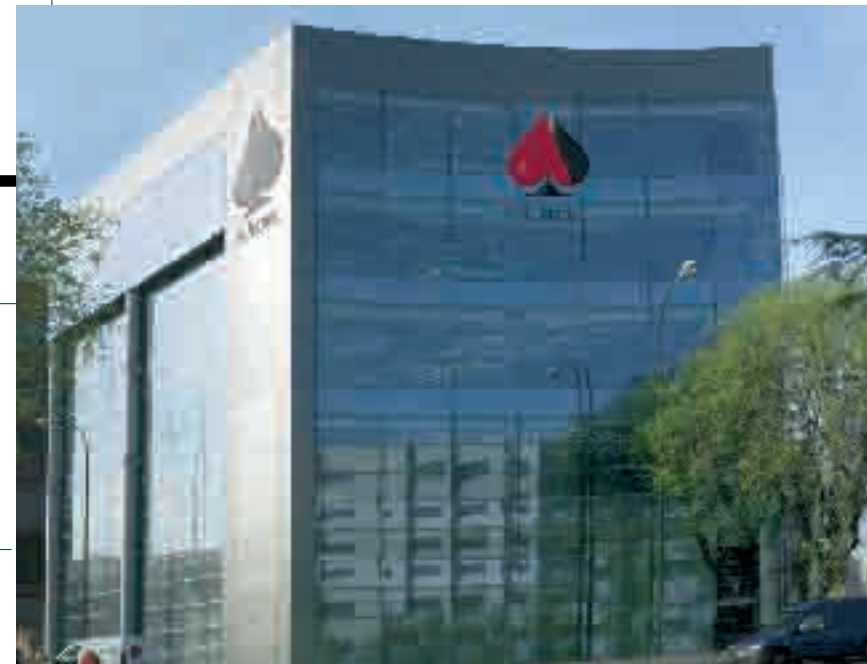
RF's central offices in Madrid

They started their business in the amusement industry in 1965, with the exploitation of slot machines. Ten years later, they incorporated Recreativos Franco, S.A., which began to manufacture the first machines with a proprietary trademark.