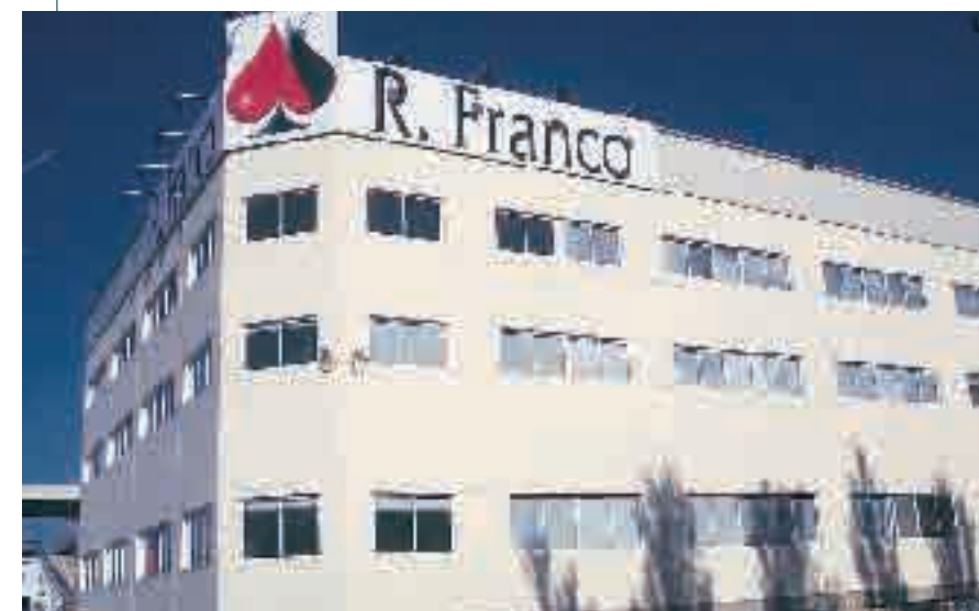
RF factory near Madrid

At the same time, the Group continued its growth in the Spanish market and, in 1979, it achieved leadership in the manufacture of slot machines.