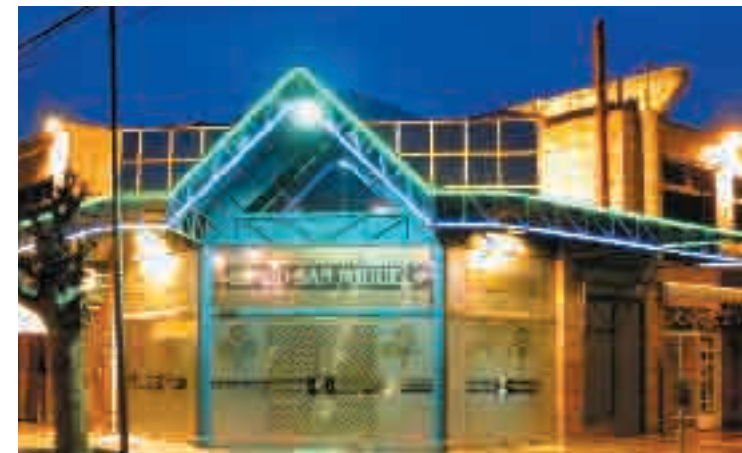
Bingo Hall San Miguel, Argentina