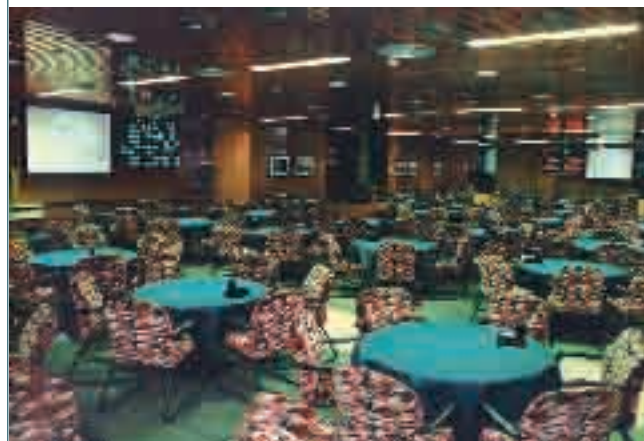
Bingo Hall Canoe, Spain