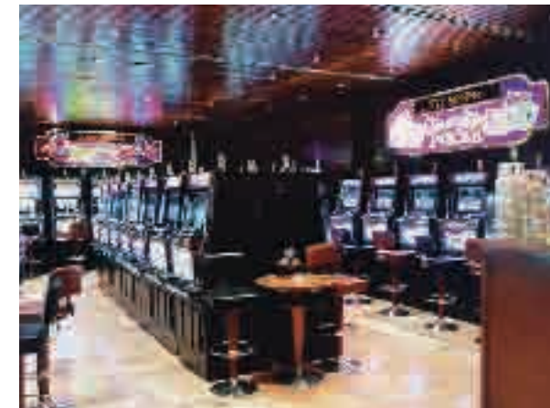
Gran Casino Murcia, Spain

Its investment policy, exhaustive quality control and service guarantee lead the Orenes Group to be sought internationally as an international partner for new business in the gaming sector.