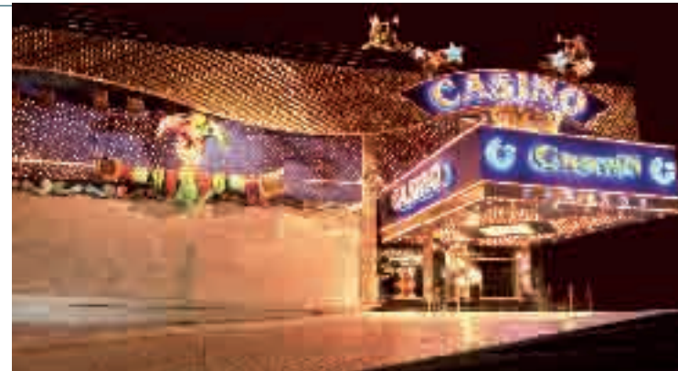
Casino Arlequín, Panamá

In recent years, it has become one of the best positioned firms in the Mexican gaming market, following the installation of electronic Bingo terminals, and it is seeking the concession of various Casinos if these are finally authorised by legislation in that country.