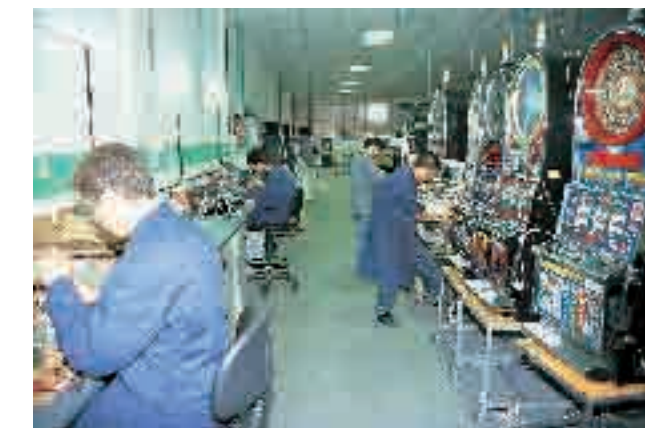
Factory in Buenos Aires