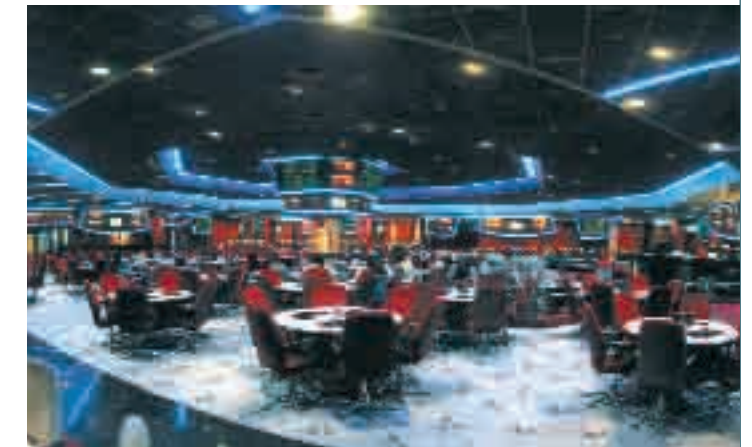
Bingo Hall Jaime I, Spain