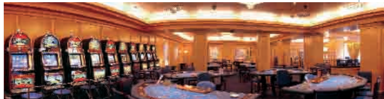
View of the Casino Miro Dubrovnik, Croatia

This is now one of Spain's leading operators in the sector, with 9,000 machines distributed among 4,000 premises. It has four Casinos in Croatia: Casino Miro in Dubrovnik, Casino Miro in Vodice, Casino Minera in Plovanija