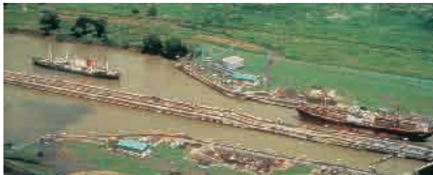
Much of international commerce passes through the Panama Canal

The second edition of "SAGSE-Centroamérica", to be held in Panama on 25 and 26 May, will be attended by a large number of European companies and by many multinational slot manufacturers, some of whom were not present in 2005. WMS Gaming, Unidesa, Aristocrat, Recreativos Franco, Gaming Partners International, Hispania Casino Equipment, TCSJohnHuxley, Copag, Fournier, DEK International... are just some of the world-famous gaming companies who will be showcasing their newest products. The list will also include many well-known companies from Eastern Europe, such as Gamey and Zero Labs, some of the biggest names from the Argentinean industry, such as BS Group, Electro Chance o Uniseis, and several Asian manufacturers.