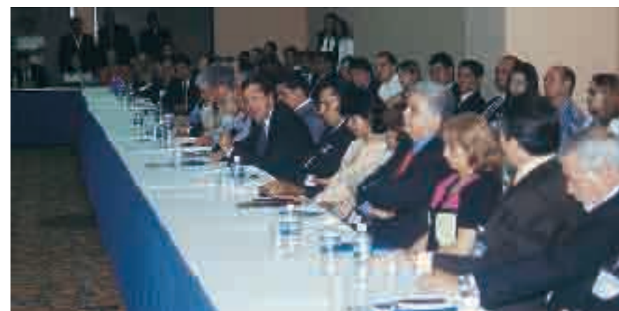
The "3rd American Congress of Gaming Regulators" will be held in conjunction with the fair