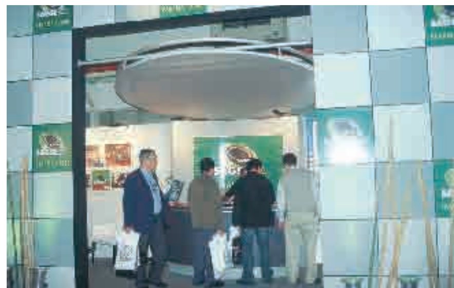
SAGSE-Centroamérica 2005 stand at the Buenos Aires fair