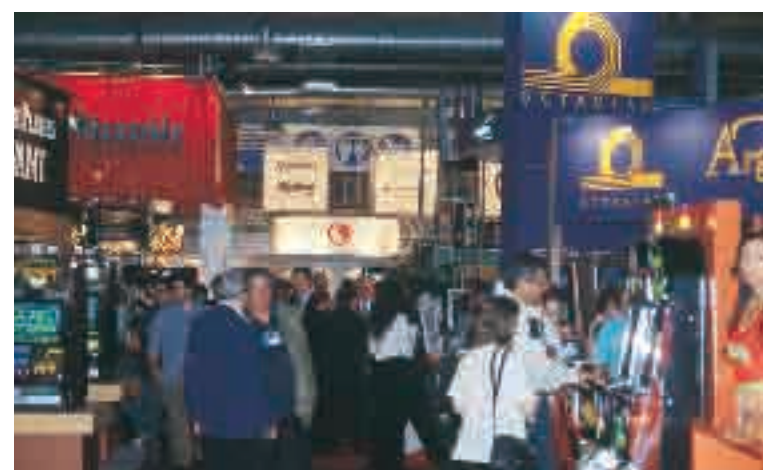
Atmosphere at the show