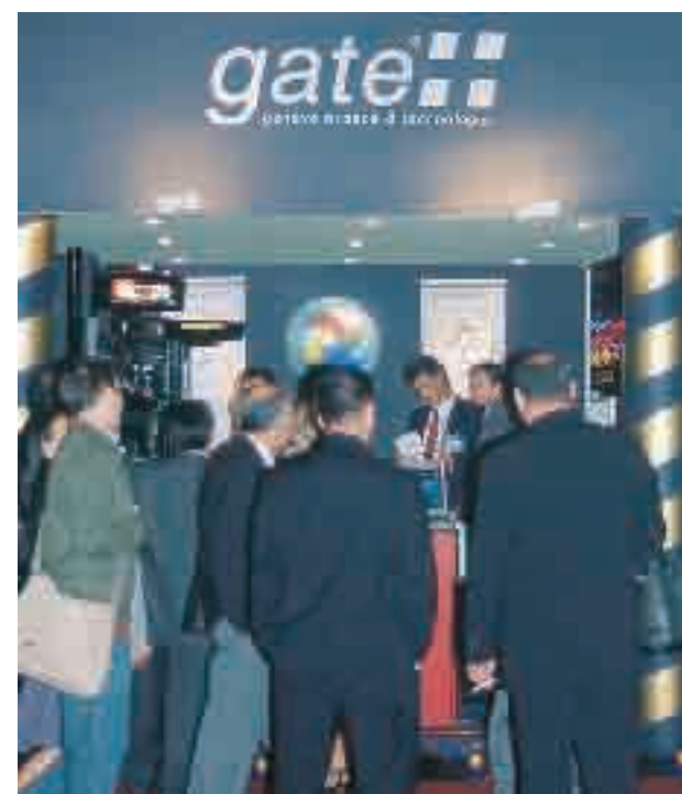
Gate +, Switzerland