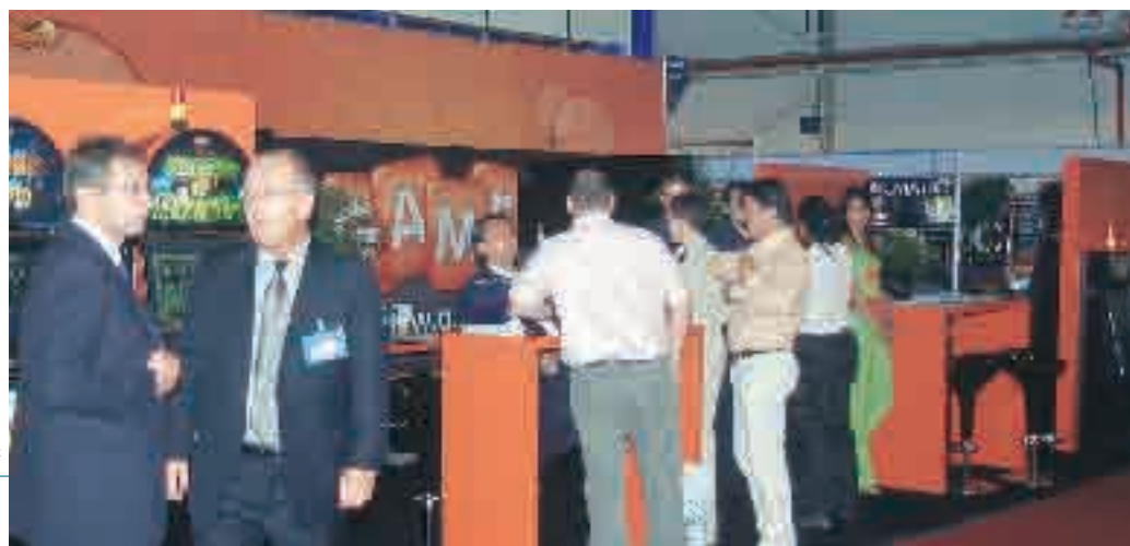
Gamey, Czech Republic

According to sources from inside the organisation, the 13th edition of this South American fair was a total success as regards both attendance and business. Official information points to more than 5,700 professional visitors, visiting some 160 stands over an area of 15,000 m 2 .