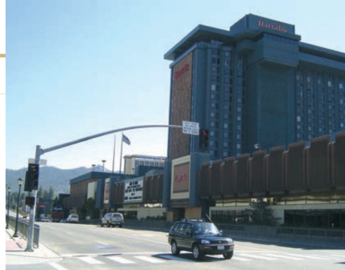
The conference took place at Harrah's Casino