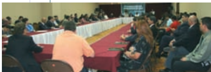
3 rd American Congress of Gaming Regulators

eNews will be emailed to Heber customers and contacts and includes the latest Heber news, information about new products and case studies featuring customers using Heber products.