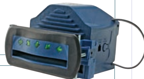
Pyramid Trilogy banknote reader

Suzo International has signed a new strategic partnership with a key dynamic manufacturer of banknote readers. Suzo International is now the Continental European distributor for Pyramid Technologies (PTI) from Arizona, USA.