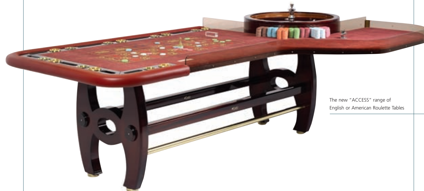
The new "ACCESS" range of English or American Roulette Tables

This top-of-the-range collection is characterised by a very modern base, which has the advantage of strengthening the rigidity of the table.