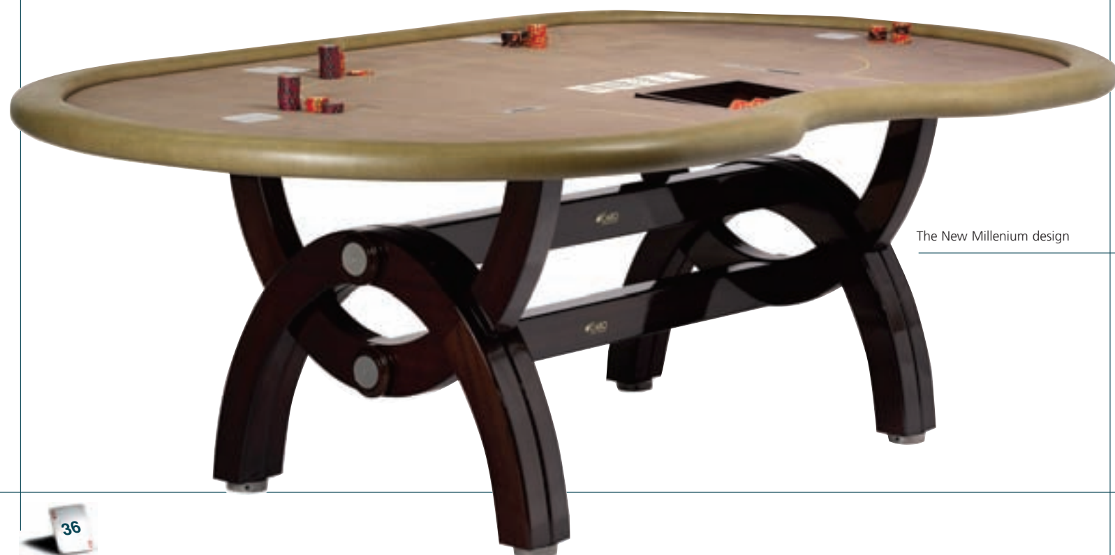
The New Millenium design

Finally, at the end of the year, Caro Developpement will launch the first ever French made Automatic Roulette Table, a blend of tradition and technology. Tradition, on the one hand, represented by the presence of a croupier at the controls of the roulette wheel, giving a human dimension to this product of the future. And high technology, on the other hand, via touch screens, bill validators and especially through the world exclusive integration of biometric terminals directly into the table! Elsewhere, Caro Developpement has experienced real expansion in its slot machine business thanks to the