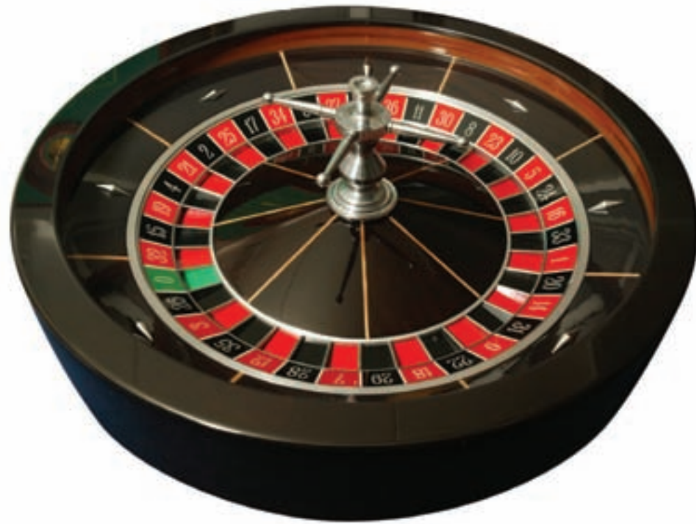
English Roulette Wheel

Manufacturing gaming equipment since 1816 and now also distributing slots, Caro Developpement enjoys a solid reputation, and has been garnering great praise for a year now, by rebuilding teams around two priorities: competence and dynamism; and by implementing a real research and development strategy. The company's watch-word is to optimise know-how in order to offer personalised solutions and a service adapted to the needs of customers.