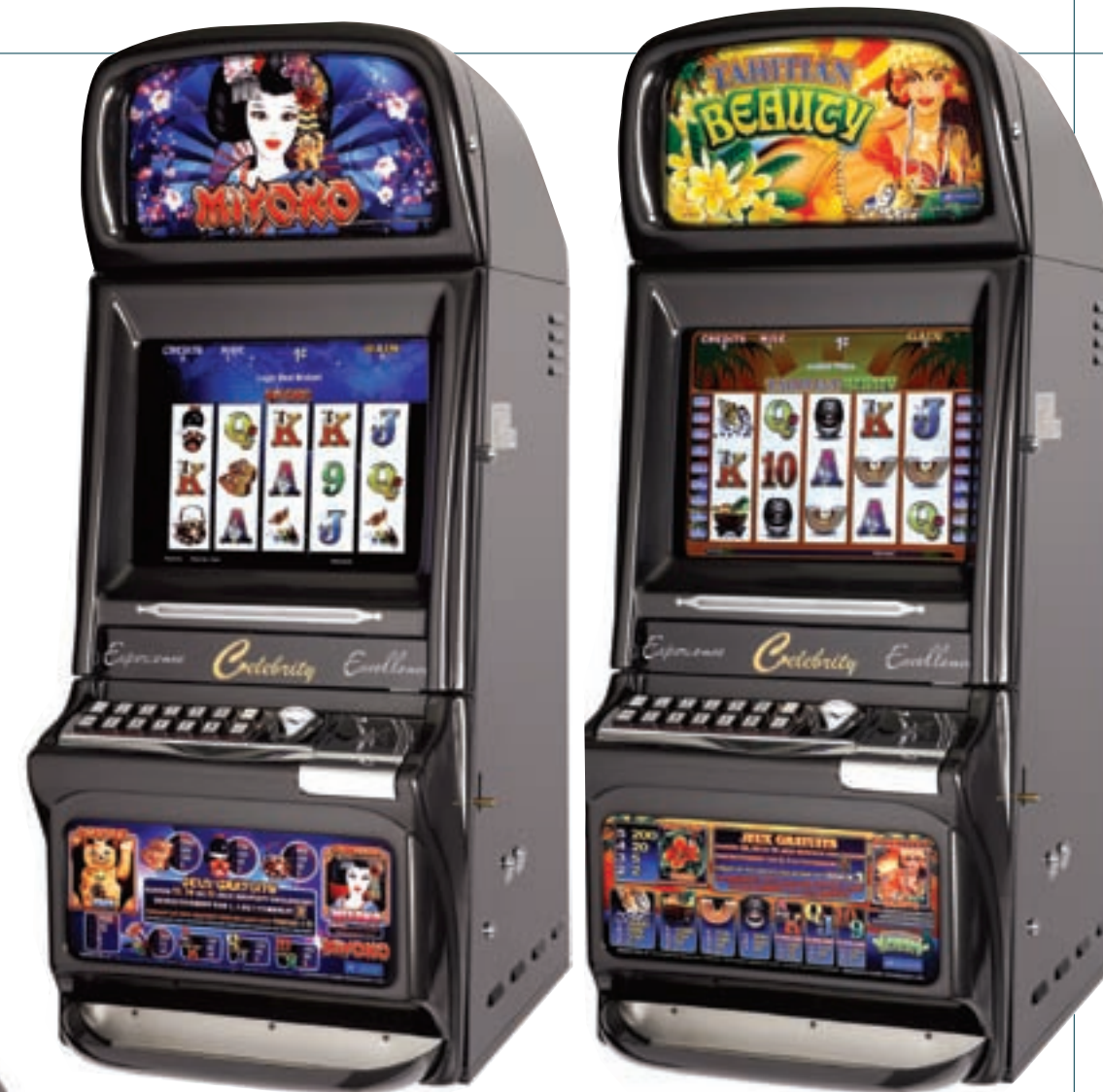
"Miyoko" and "Tahitian Beauty", the two last games from Ainsworth Game Technology that are exclusively distributed by Caro Developpement in France

increase in its range of games: in fact, before the end of 2006, seven new games will be added to the Ainsworth Game Technology range, which already has 10 different models. A new Dragon model, Wild Joker Poker, has also been added the market since recently. These are the dynamics within which Caro Developpement has developed its identity thanks to resolutely modern communication. A new logo and new colours adorn the product catalogue issued this summer, the CD-Rom version of which is expected out in late October. The web site, which was launched in early September, has recently allowed people to pre-order on-line and in 2007 will offer a virtual tool for customers to build their own tailor-made tables. A modernised image, an extended range of products and a personalised marketing approach: new Caro Developpement assets, shortly on show at ICE London on 23, 24 and 25 January 2007!