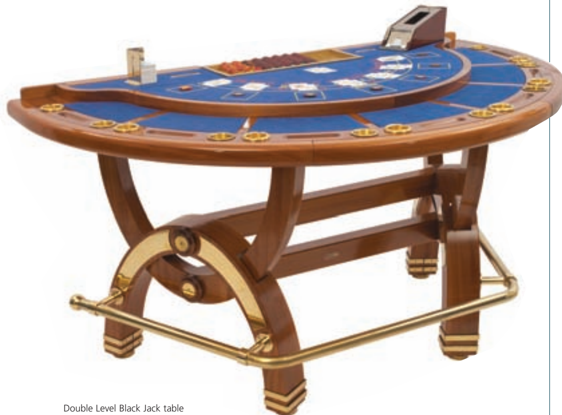
Double Level Black Jack table