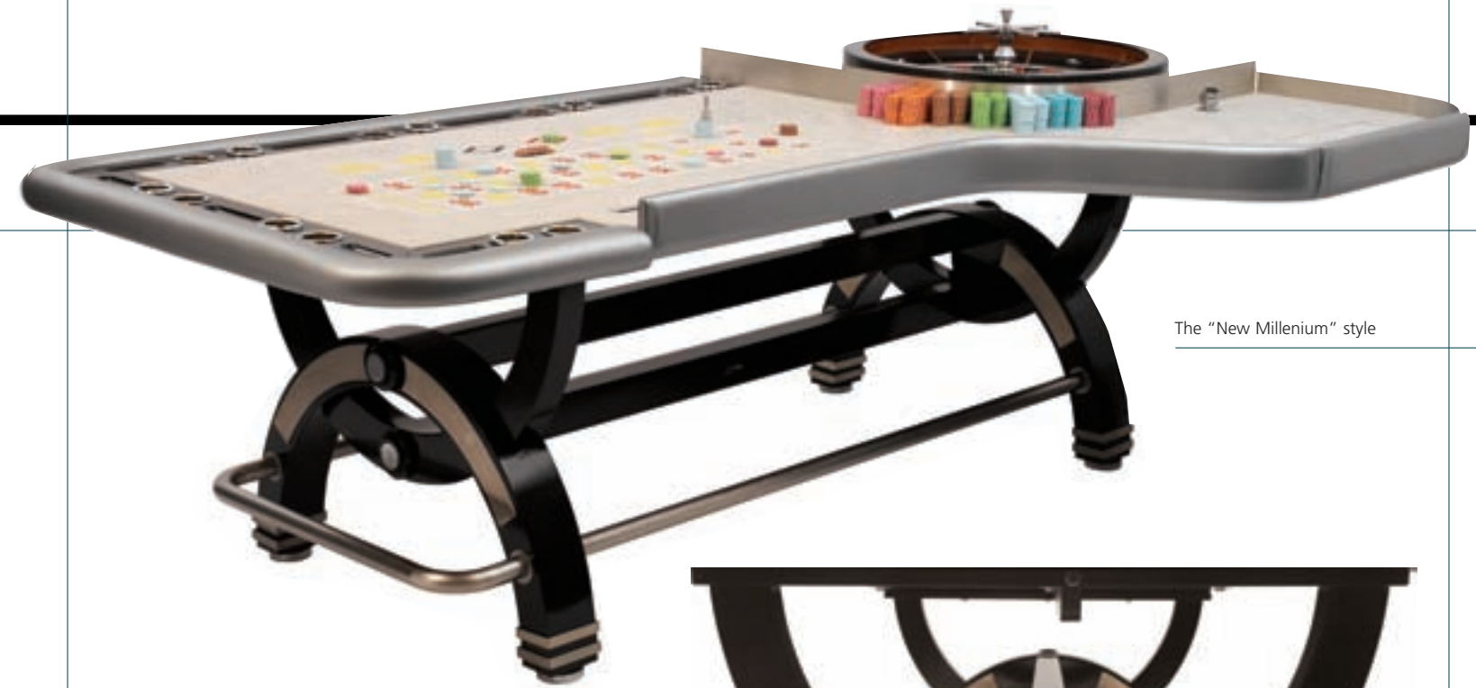
The "New Millenium" style