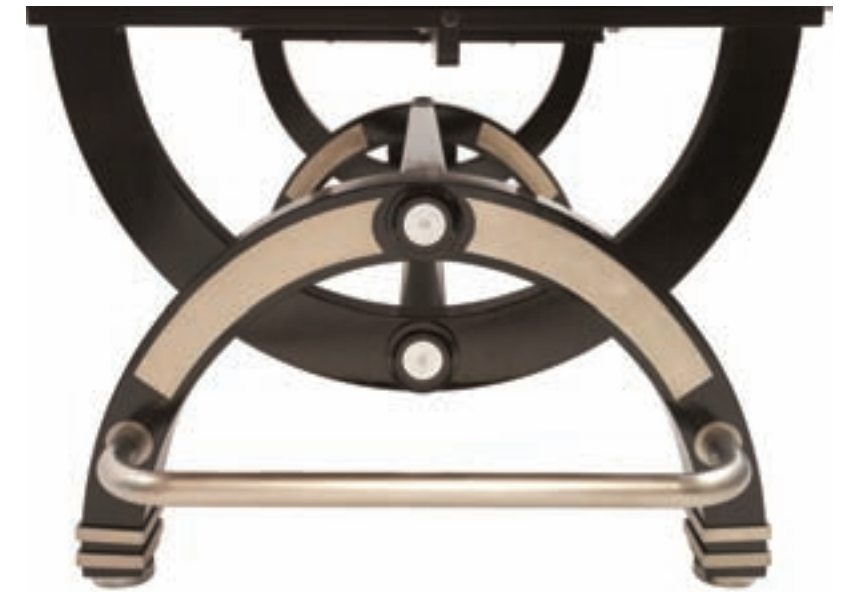
"New Millenium" base

In early 2006 Caro Developpement launched a new range of tables: the "New Millenium" collection. The collection is totally contemporary and aims to meet the most exacting demands in terms of appearance.