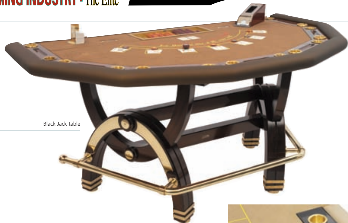
Black Jack table

Another collection of the same high quality but more reasonably priced is currently being developed and will be launched under the name "Access" before the end of this year.