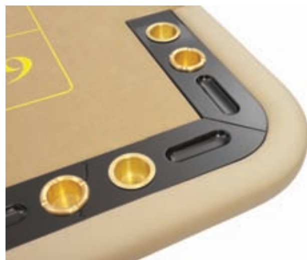
Example of surround bead. Materials and colours on demand

This year also, Caro Developpement has considerably increased the choice of equipment and colours available to customers, allowing them to define the finishing of their own Live Games products, thus devising their own tailor-made Casinos! In order to adapt to specific Casino requirements, Caro Developpement is also manufacturing Texas Hold'em tables, which can be personalised on request (dimensions, bases and other options).